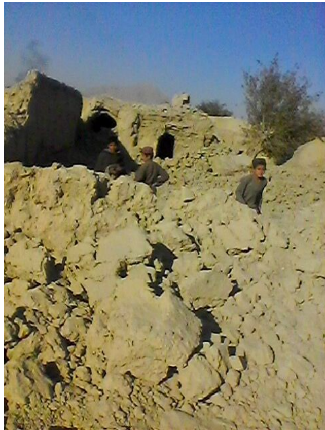
Figure 4 - Children playing in the ruins of one of the buildings destroyed by the air strikes on 19 November 2017, Moosaqala, Hilmand.

Reports collected for this report from those in the area that night say more civilians could have been killed were it not for many of the buildings being empty, occupied only by watchmen after daylight hours. Even the house where the Taliban soldiers usually stayed was thought to be empty. It is also alleged that the slight delay between the air strikes allowed any occupants to escape to the river to the west of the opium bazaar. No such opportunity was afforded to Hajji Habibullah and his family as it was his compound that was first struck.