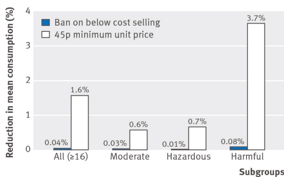
Fig 2 Modelled impact of a ban on below cost selling compared with impact of a 45p minimum unit price